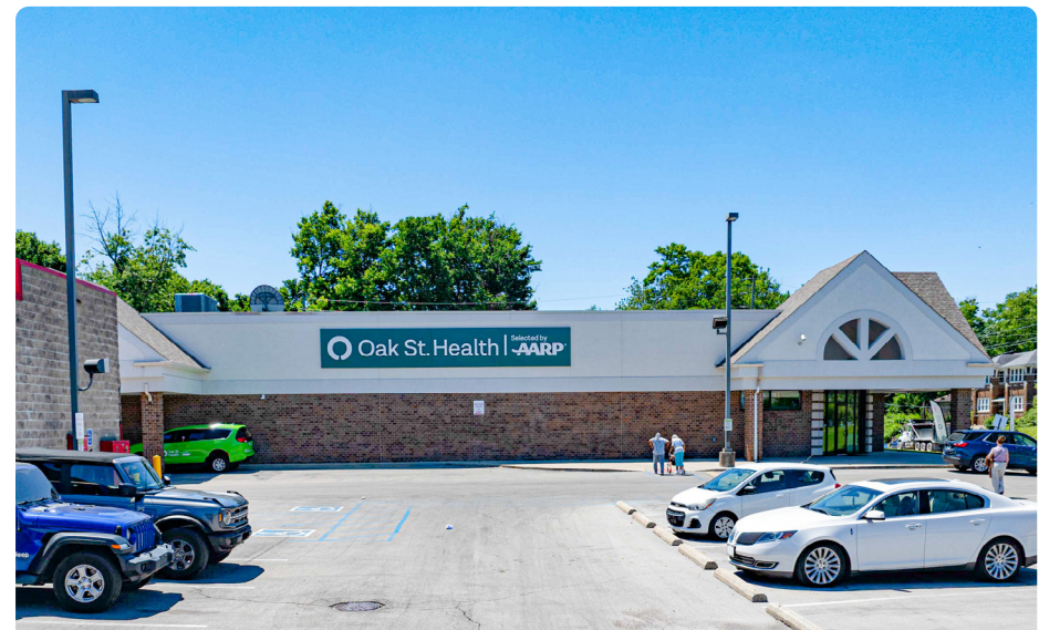
711 E 38th St | Indianapolis, IN 46205

Price: $4,888,889 Cap Rate: 6.75% Lease Term: ±12.41 Years