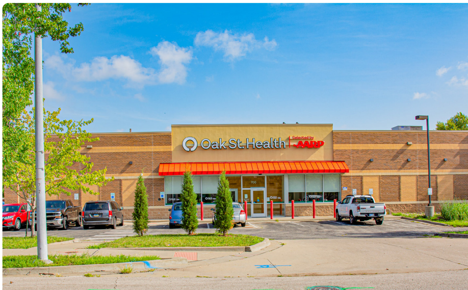
700 Nebraska Ave | Kansas City, KS 66101

Together, the assets comprise approximately 20,800 square feet and generate stable cash flow backed by a healthcare operator whose services are deeply integrated into their local communities. With a blended cap rate of 6.75%, strong real estate fundamentals, and remaining lease terms of more than 12 years, this portfolio presents an attractive opportunity for investors seeking durable income, healthcare sector exposure, and the efficiency of acquiring two high-quality assets in a single transaction.