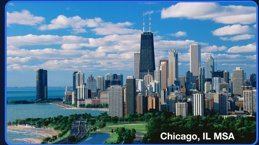
Chicago, IL MSA