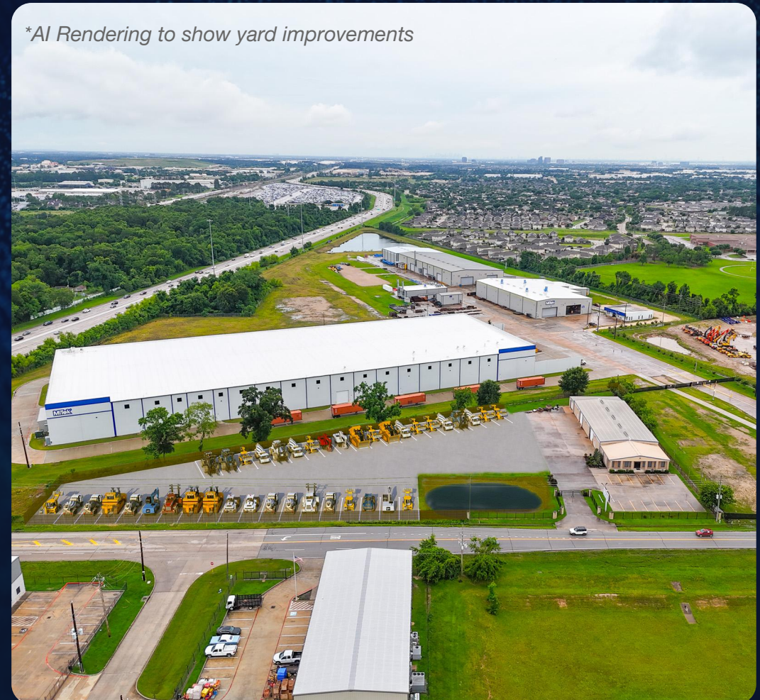
*AI Rendering to show yard improvements