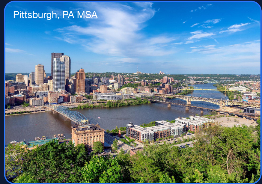
Pittsburgh, PA MSA