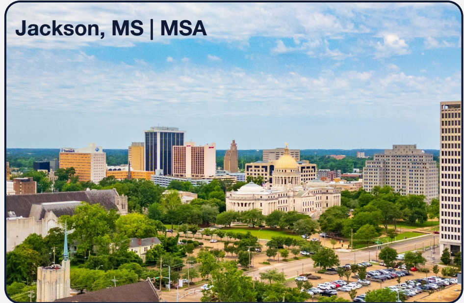
Jackson, MS | MSA

Supporting Workforce Retention And Local Spending