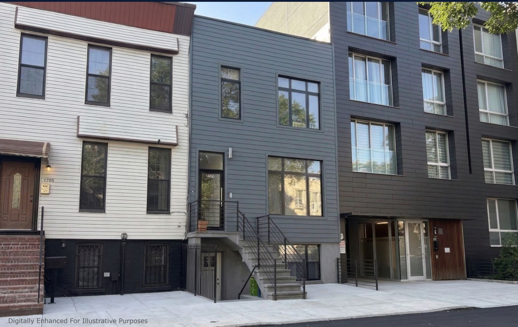
Digitally Enhanced For Illustrative Purposes

Multifamily Investment Opportunity | Offering Memorandum