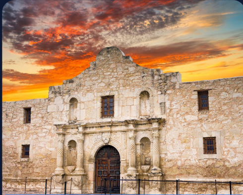
San Antonio, TX MSA