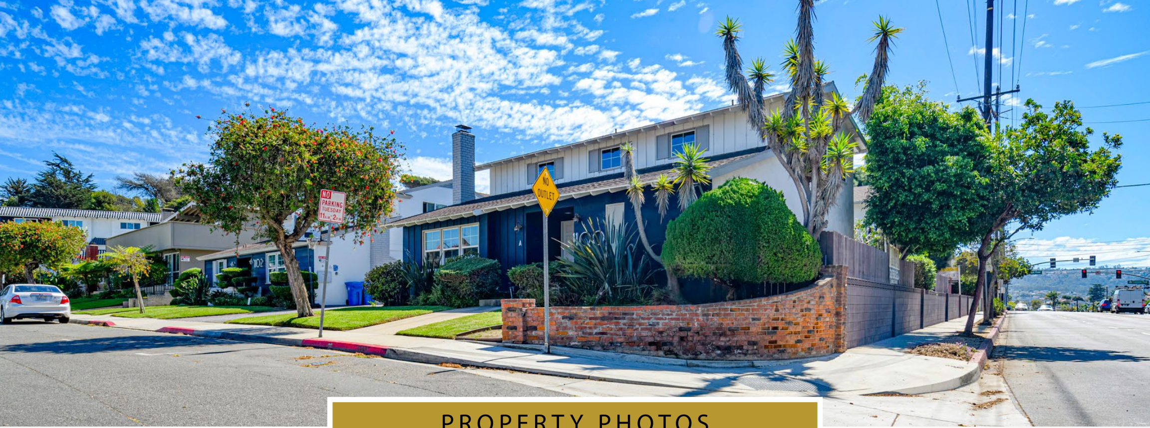
PROPERTY PHOTOS 1100 BARBARA STREET, REDONDO BEACH, CA 90277